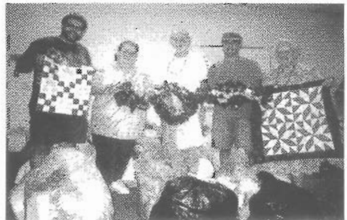
Volunteers are showing handcrafted items for large church bags given to small congregations.

Without volunteers who have given their time and support to this ministry, we would not be able to reach out to help the poor and needy - those that God calls "your neighbor." As the ministry has expanded in successful outreaches, so has our own need for a strong financial support base been increased. Once again our warehouse and office space has outgrown capacity. Due to overcrowded space conditions in our present offices we have to move into larger quarters as soon as possible. This means another step of faith, and doubling of our monthly lease expenses. It is a scary and challenging step for us - a step we cannot take without your help and God's continuing blessing. No financial gift would be too small to give us the encouragement we need now to go on in faith. Short term commitments, and one time gifts of any amount, would mean so much at this critical time in our twenty-five years of God's service - Love Lifting up and blessing needy people in the forgotten places of our world.