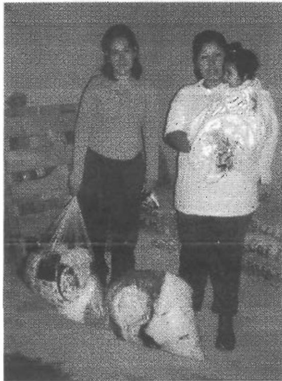
These two women were blessed with God’s joy when they were given our baby layettes filled with items needed to care for their newborn babies.

Thank you for answering the critical needs of Love-Lift 2001 . In Luke 10:27 we find a compelling commandment – “You shall love your God with all your heart, your soul, your strength, your mind, and your neighbor as yourself...but who is my neighbor?” God’s answer: the person with a need is our neighbor.