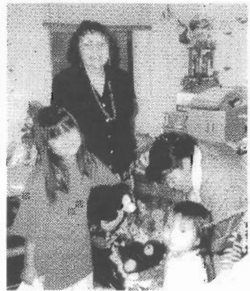
This Navaho family received your gifts.

Now that Love-Lift Ministries is an independent, nonprofit corporation, and faith based ministry with our own facility our needs for financial help, and volunteer labor are greater now than ever. Our monthly financial needs include two major areas: The rent for our Headquarters facility is $1,820.00. Add to this the cost of utilities. Our monthly budget also includes $1,500.00 used for purchasing the inventory items needed for our volunteers to fill an average of 450 gift-bags every month. We are careful in making purchases of items at the lowest cost possible. Our regular and faithful workshop volunteers are few in numbers. More volunteers are urgently needed. You, or your organization, are urged to call to find out more about how and when you can volunteer to work with us. Ask how you can arrange to visit our facility, or ask to arrange for a speaking and display presentation of Love-Lift Ministries at your church, school, or organization. We need you!