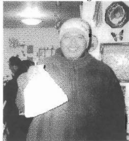
Young American Indian receives gift a bag.

White Eagles Christian Academy ( www.whiteeaglechristianacademy.com ) is an oasis of opportunity and hope in this desolate place. Here selected young American Indian students are given a quality general education, including computer and media production skills, while also learning Christian values by experiencing them. The plan is to develop young Christian leaders who have a desire to serve their people in the Name of the Lord so that future generations